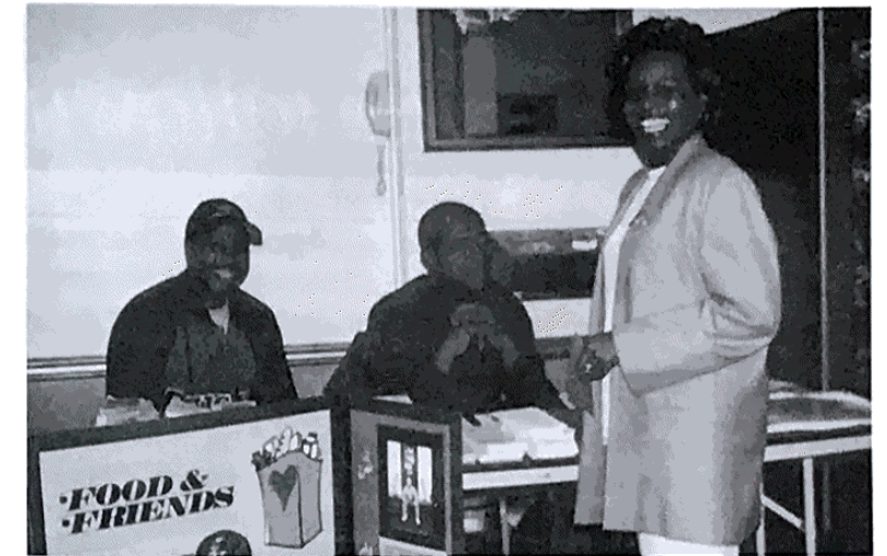
Food & Friends' table at the "Gospel" Health Fair